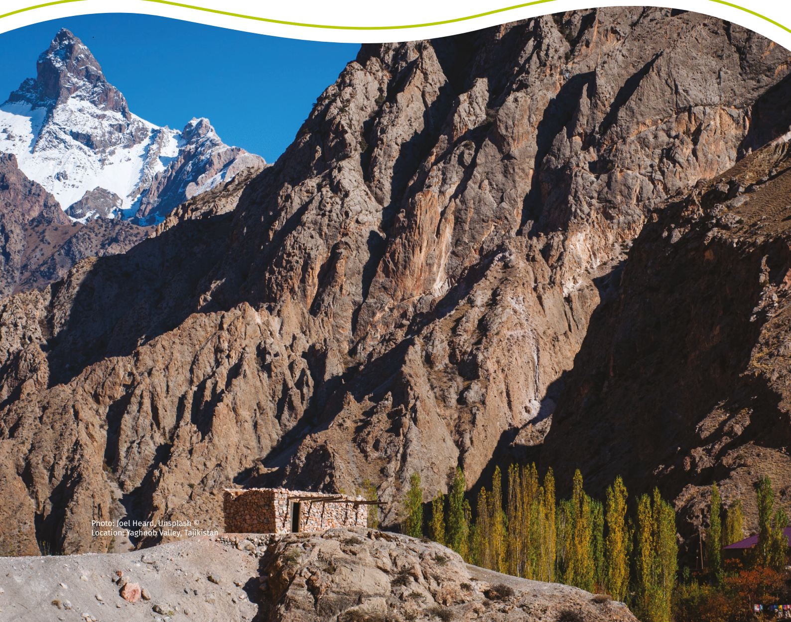
Location: Yaghnob Valley, Tajikistan

This project is funded by the German Federal Environment Ministry's Advisory Assistance Programme (AAP) for environmental protection in the countries of Central and Eastern Europe, the Caucasus and Central Asia and other countries neighbouring the European Union. It is supervised by the German Environment Agency (UBA). The responsibility for the content of this publication lies with the authors.